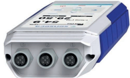
PRO D05.3 - 3 inputs, M12 sensor connectors