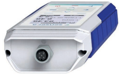
PRO D01 - 1 input, M12 sensor connectors