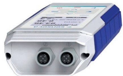
PRO D05.2 - 2 inputs, M12 sensor connectors