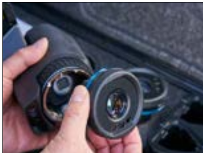
Share lenses (wide angle to telephoto) across your fleet of cameras thanks to AutoCal™ optics