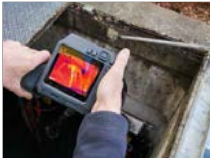
Up to 161,472 pixel resolution for accurate readings on distant targets