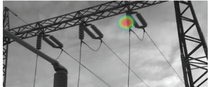
Example of Si124 PD severity assessment