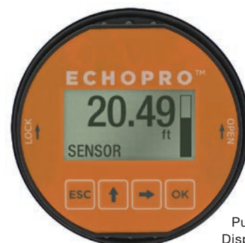
Push Button Display Module