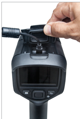
Download images fast via USB

Specifications are subject to change without notice. For the most up-to-date specifications, go to www.flir.com