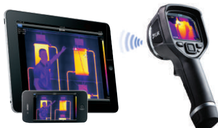
Wireless Connectivity to Smartphones, Tablets and more.

PORTLAND Corporate Headquarters FLIR Systems, Inc. 27700 SW Parkway Ave. Wilsonville, OR 97070 PH: +1 866.477.3687